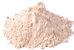
AP 920 | 820 Spray Dried Plasma Powder

Solutein is a multi-purpose water soluble and (top dress) feed additive management tool. It contains plasma and serum proteins as well as other vital nutrients for swine health and nutrition. Please ask for the Solutein brochure for details on mixing and feeding rates.