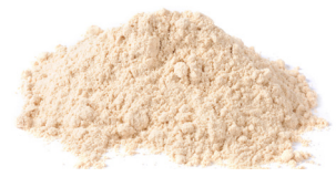
SOLUTEIN Soluble Protein Blend

MULTIPLE STUDIES DEMONSTRATE THAT ADDING SPRAY DRIED PLASMA (SDP) TO PIG DIETS LEADS TO INCREASED GROWTH PERFORMANCE, REDUCED INFLAMMATION, REDUCED DIARRHEA AND IMPROVED AVERAGE DAILY GAIN AND SURVIVAL.