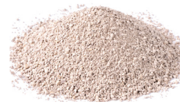
APPETEIN Granulated Plasma